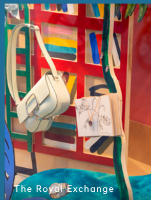
The Royal Exchange