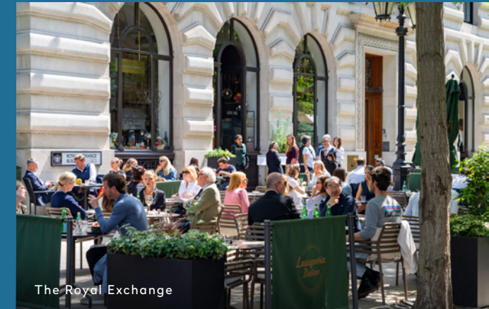
The Royal Exchange